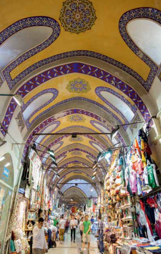
Clockwise from top left: shopping in the Grand Bazaar; mint liqueur at Sumahan hotel; Lokanta Maya's tulum cheese pâté; shepherd's salad, Sumahan; Lokanta Maya; city vista; fresh plate at Mikla; pear creation from Vault; Noah's pudding; Cengelkoy bread seller

The view from here across the curling estuary of the Golden Horn is stunning. Mikla's glitzy, clever cooking handles all the tricks of a modern chef's craft. Everything eats as well as it looks. Ekmek balık , translated as 'bread-fish', is a twist on the no-nonsense fish sandwich: two fillets of Black Sea anchovy glistening between gauze-like Melba toast. Plum pesto and wild garlic accompany slow-cooked knuckle of Thracian lamb. Red mullet and fennel shavings swaddle smoky fırık (cracked wheat). Sour cherry compote stirred into bulgur, toasted almonds, mulberry tuile and sun-dried cherries come with an ice cream of honey and