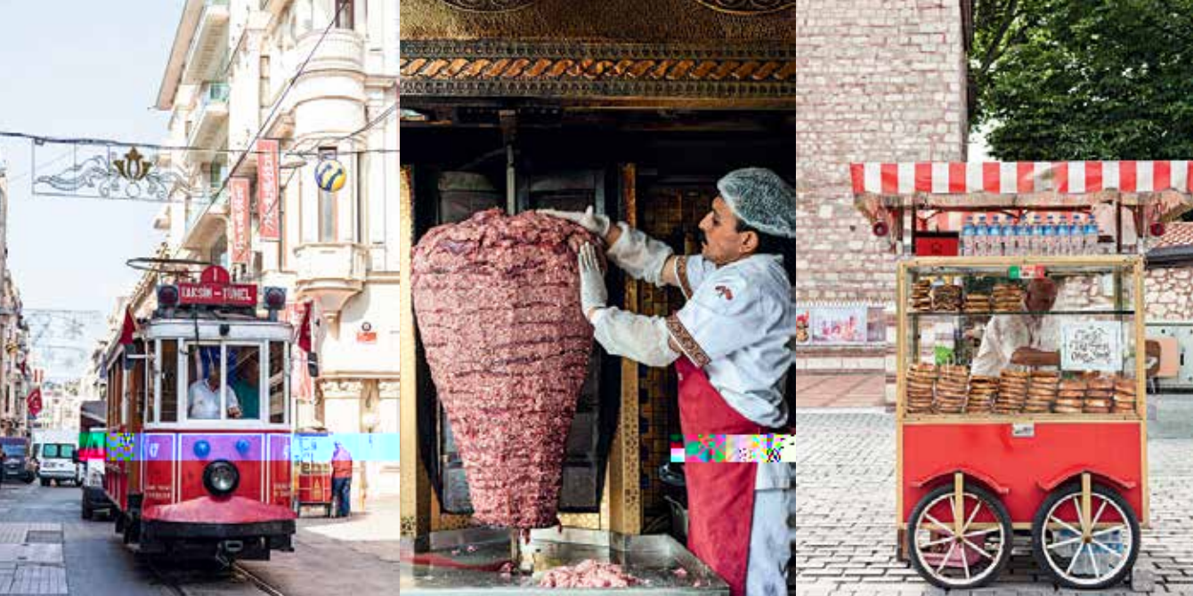
Left to right: an old-fashioned tram; doner kebab meat; bread and pastry cart. Below: lahmacun , Turkish pizza. Opposite, clockwise from top left: at the Spice Market; late-night snack stall; back streets; bird's nest baklava; the market in full swing

‘Cay, without milk, is the national drink. Hasn’t Unesco added it to its list of the Intangible Cultural Heritage of Humanity along with Mongolian calligraphy?’